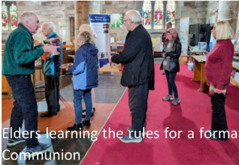
Elders learning the rules for a formal Communion