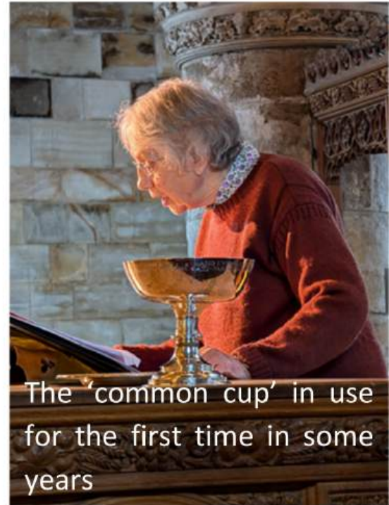
The 'common cup' in use for the first time in some years