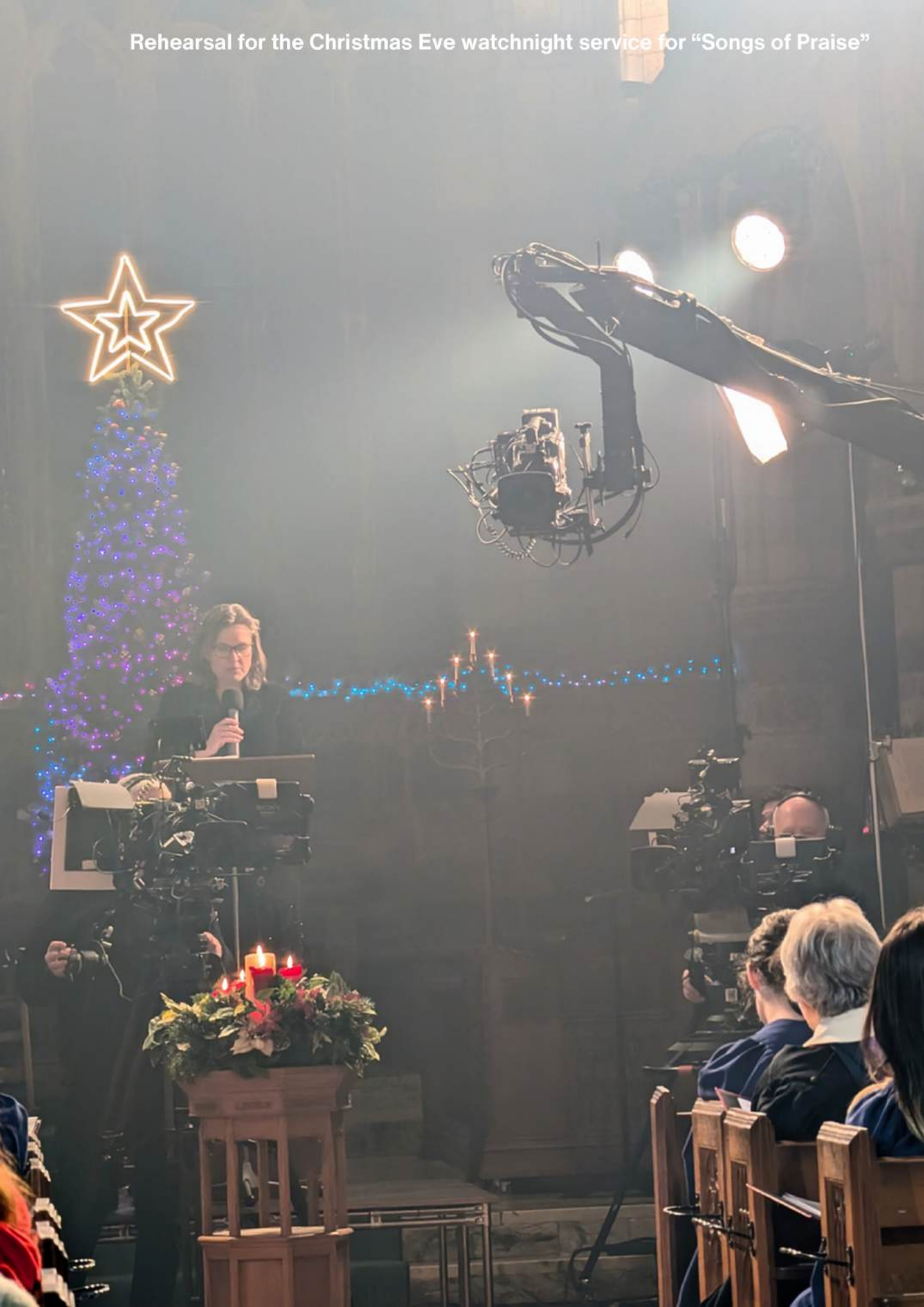
Rehearsal for the Christmas Eve watchnight service for "Songs of Praise"