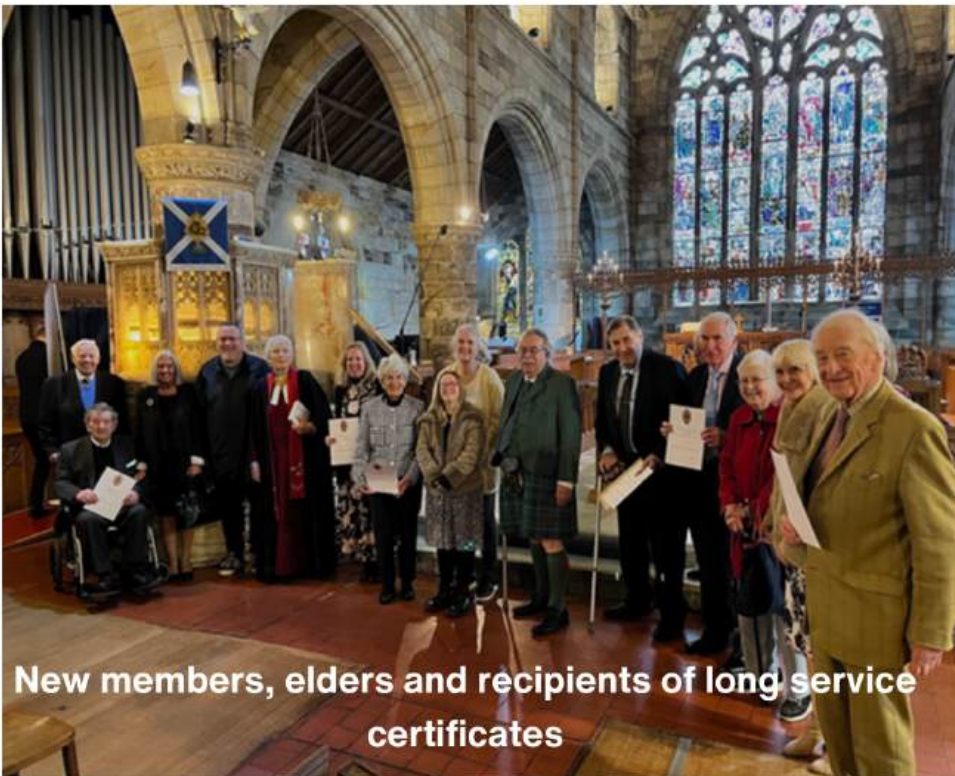
New members, elders and recipients of long service certificates